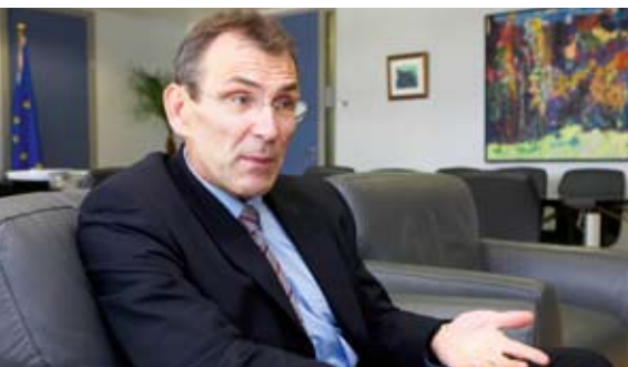
Andris Piebalgs is European Commissioner for Energy

We will need to educate our children to think as global citizens and prepare them for the historic transition from 20th century conventional geopolitics to 21st century global biosphere politics. Education will increasingly focus on both global responsibility to