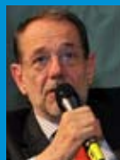
Javier Solana EU Representative for CFSP