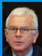
Hans-Gert Pöttering European Parliament President