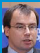
Gareth Thomas MP Parliamentary Under Secretary of State for the UK's Department for International Development (DFID)