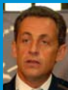
Nicolas Sarkozy French President

Recent contributors to Friends of Europe's activities include: