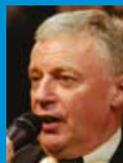
John Monks Secretary General, European Trade Union Confederation (ETUC)