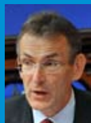
Andris Piebalgs EU Commissioner for Energy