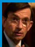
Jeroen van der Veer CEO, Royal Dutch Shell plc