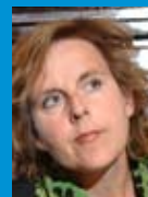
Connie Hedegaard Danish Minister for EU