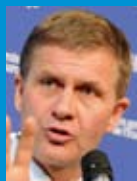
Erik Solheim Norwegian Minister for the Environment and International Development