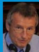
Martin Bartenstein Austrian Ministry of the Economy