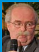
Christophe de Margerie Chief Executive Officer of Total