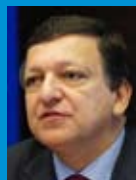
José Manuel Barroso European Commission President